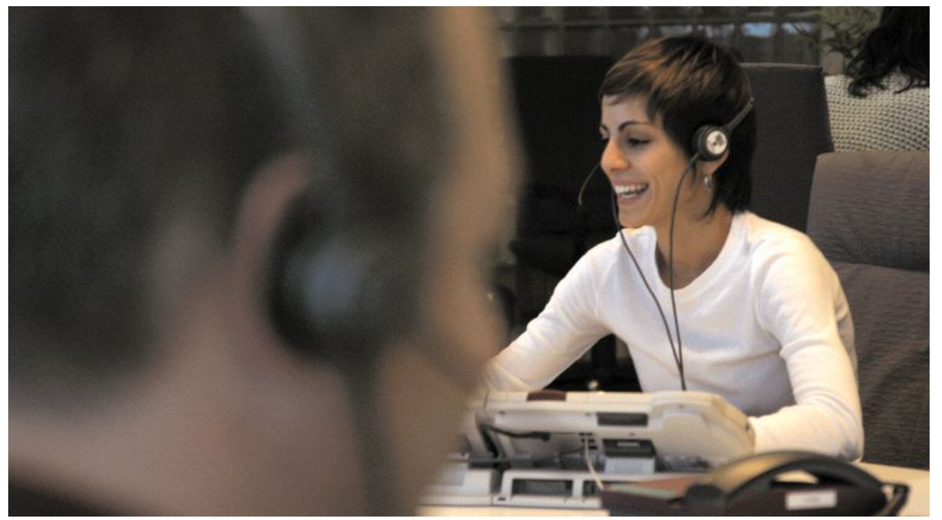
A friendly smile for a HS