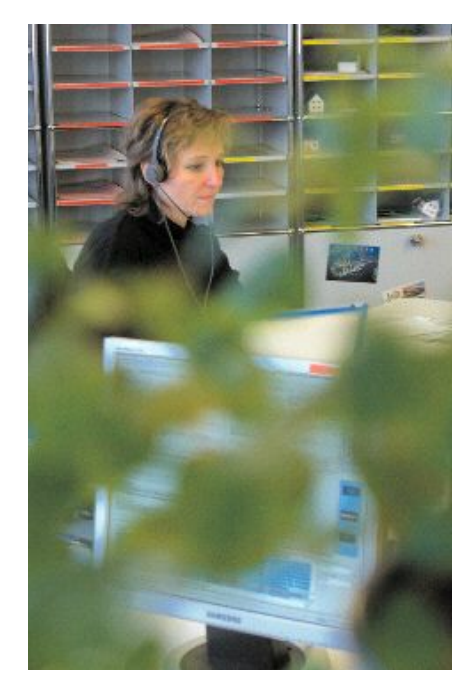
The number 140 is dialled up to 1500 times each day

to lead her horse into the barn. And as I already was there I washed also its fodder sack." And if it happens TCS patrols replace also the drive belt of the kneading machine of a bakery. Sam shrugs his shoulders laughing: "People have lots of different ideas. We are at their disposal, to meet them all."